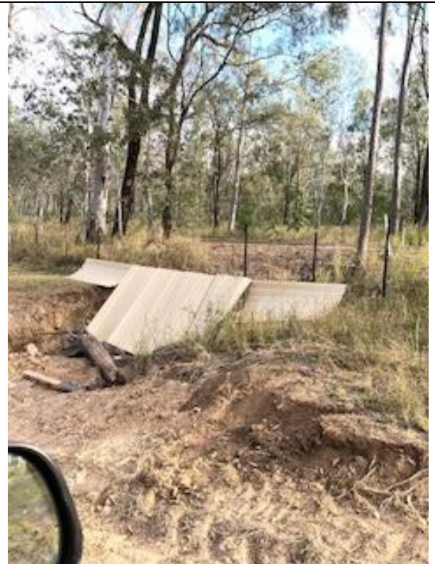
Hinged Colourbond panel to discourage livestock