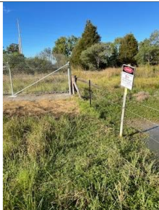
Retensioned fence at southern end of western boundary