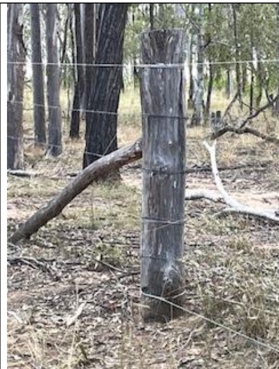
New plain wires visible at top and bottom of existing post