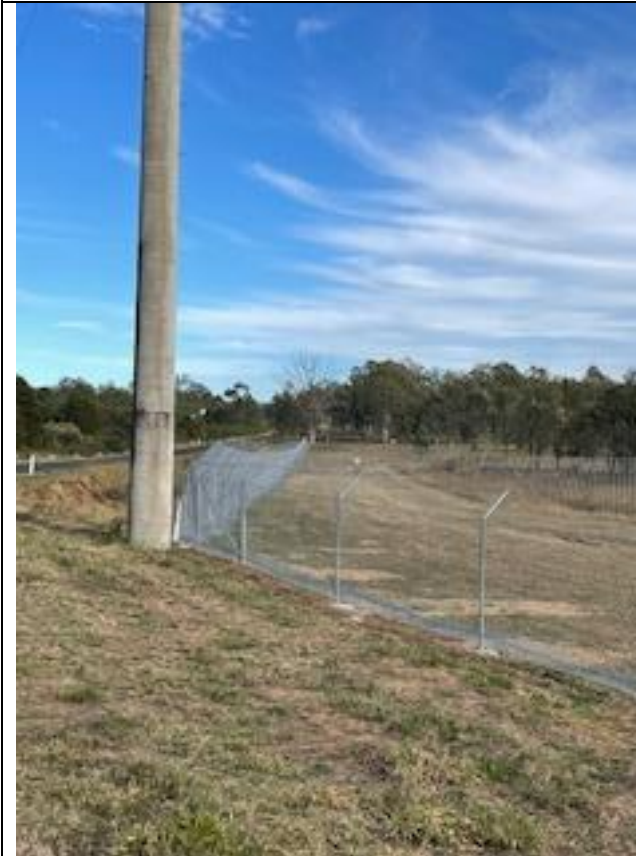
View to west from bend in fence