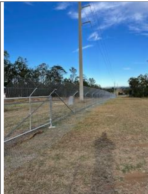
View to west towards western gate