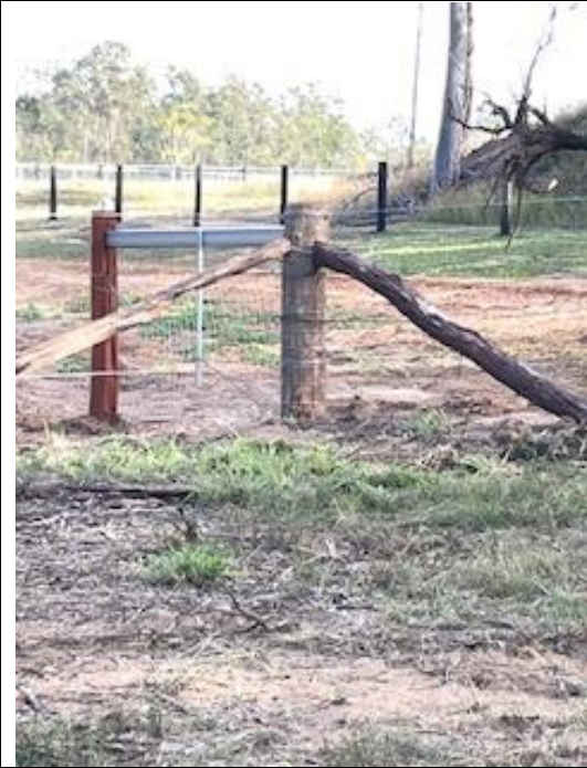
New post and braces in northwest corner