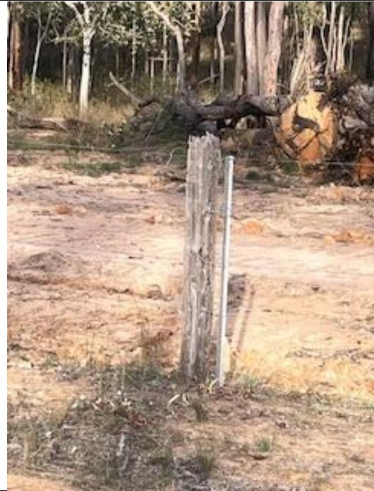
Steel partner post installed to support existing post