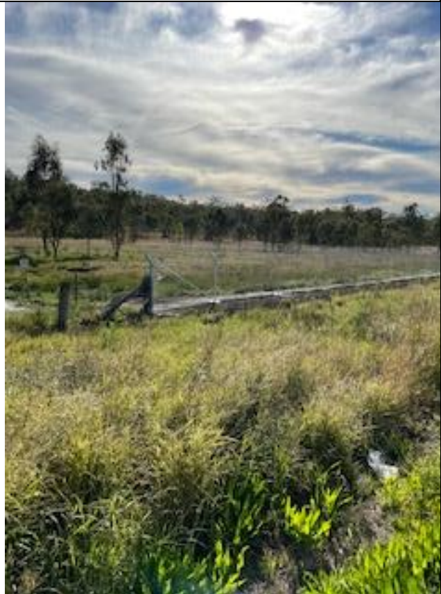
View to east from western end of fence showing gravel bund